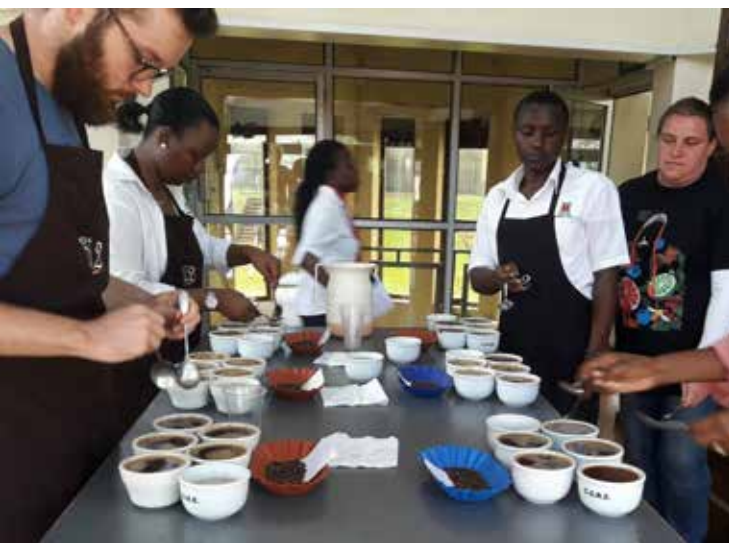
Zombo Classic Lot 1 landed sample - cupping results from Havana Coffee Works.

vibrant soft deep lingering rounded syrupy smooth